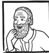
Levi when Jesus called him to follow him.

Colour in a face to show how these people felt.